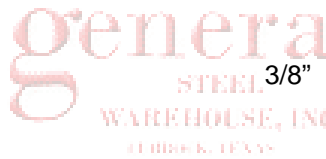
PLATE STEEL – ALLOY